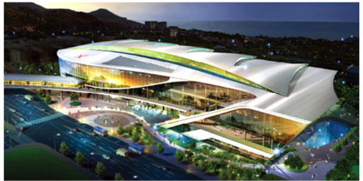
New Exhibition Hall

The form of the original Exhibition Center resembles a seagull. In order to harmonize with this existing theme, the new buildings emulate the shape of a boat, with the roof resembling waves. This also helps the buildings to blend in well with the surrounding environment; the location is very close to the South Sea.